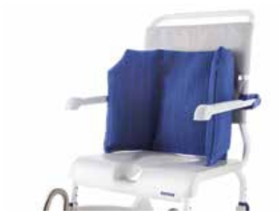
Soft backrest cushion

Provides a stable seating position. Easy to clean - useful for multiple client use.