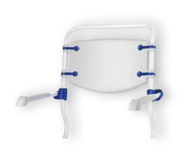
Solid plastic backrest

This is particularly beneficial for clients who have degenerative conditions such as MS or MND , who may need additional support as their condition changes.