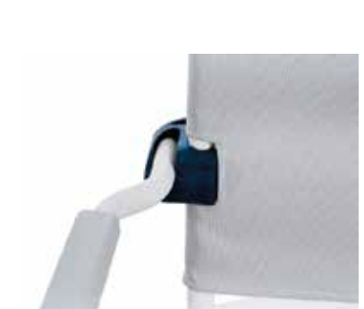
Wider XL armrests

Increases the distance between the armrests by 40mm each side